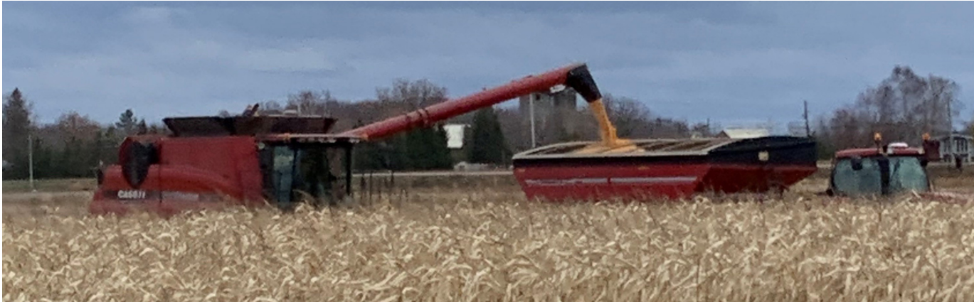
A sustainable nutrient management strategy reduces or eliminates the need for commercial lime and fertilizers.